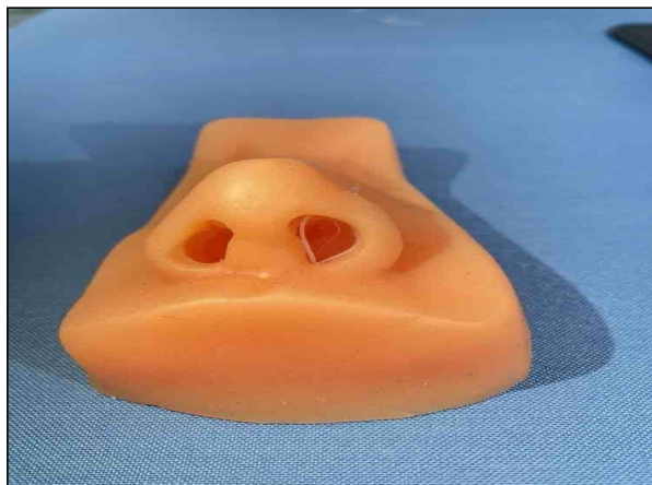
Figure 5: Complete Insertion of Bi-Valve Splints within the Nasal Simulation Model