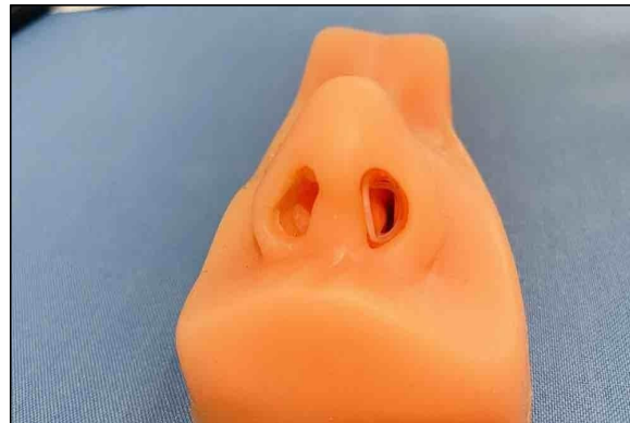
Figure 3: Complete Insertion and Placement of Airway Splints into the Nasal Simulation Model for Assessment

The airway splints are inserted into the simulation model (Figure-2), following the same procedure as during a surgical procedure, ensuring proper placement for airway support. The figure-3 represents the airway splints completely inserted into the model, effectively demonstrating their stable placement and accurate alignment within the nasal passages, ensuring optimal positioning for functionality.