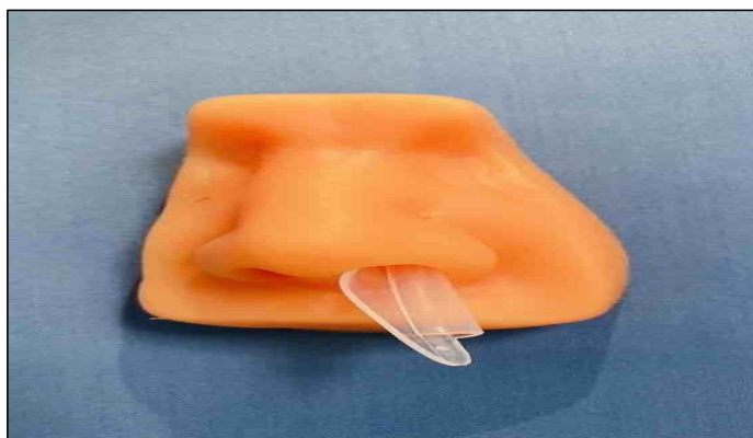
Figure 2: Insertion Process of Airway Splints into the Nasal Simulation Model for Evaluation