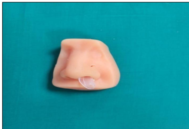
Figure 4: Insertion of Bi-Valve Splints into the Nasal Simulation Model for Evaluation

The Bi-Valve splints are inserted into the simulation model (Figure-4), replicating the surgical process and ensuring the splints are properly positioned to maintain structural support, highlighting their effectiveness in preserving nasal passage structure and ensuring they remain securely in place without shifting (Figure-5).