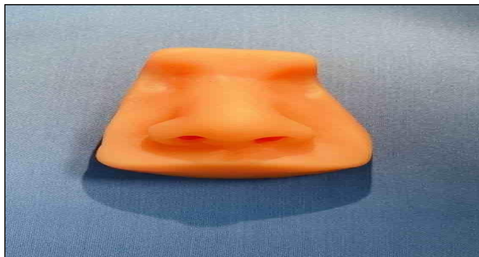
Figure 1: Experimental Setup of the Nasal Simulation Model for In-Vitro Testing

The performance of Internal Nasal Airway, Bi-Valve & Pre-cut Splints was conducted using a simple nasal simulation model. The model was designed using CT-derived anatomical data of an average adult nasal cavity the model was 3D-printed using medical-grade silicone to mimic mucosal softness and rigidity. The dimensions of the model were as follows: length 7 cm, width 3.5 cm, and height 2.5 cm. The simplified in-vitro Simulation model (Figure-1) replicates the human nasal cavity, designed to simulate post-surgical conditions for evaluating the insertion of nasal splints.